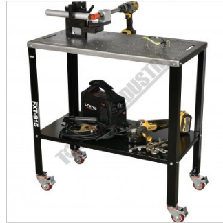
Shown Setup as a Work Bench (Accessories not included)