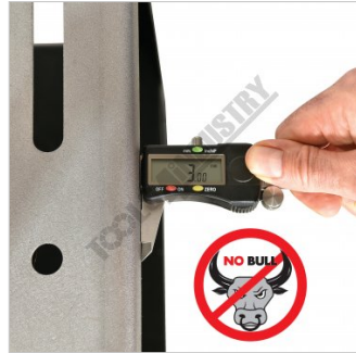
3mm Thick Bench Top