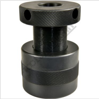
Height Adjustment Device