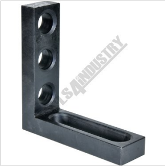
175x50x175mm Angle Bracket