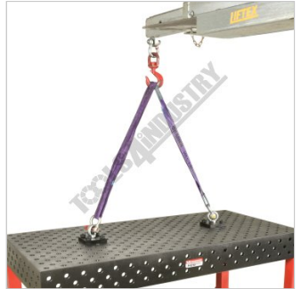
Shown using optional lifting kit