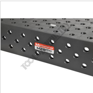
M28 Pro Table Series