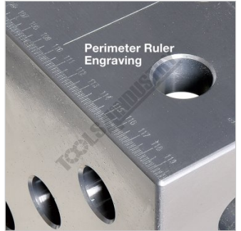
Perimeter Ruler Engraving