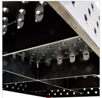
Stengthened by Welded Webbing