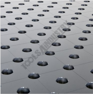
Plasma Nitriding Surface Finish