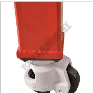
Adjustable levelling castors