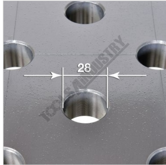
28mm Diameter Holes