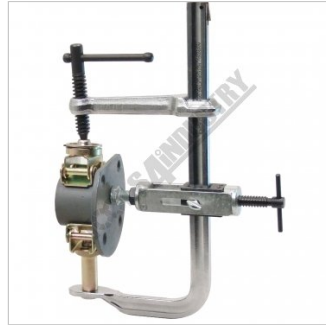
Shown Mounted to Clamp