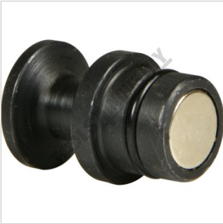
Magnetic Pin 16mm