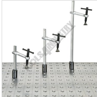
Optional Range Available