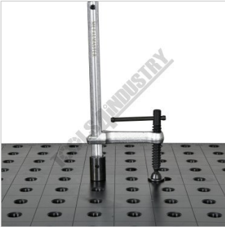
250mm Clamp Height