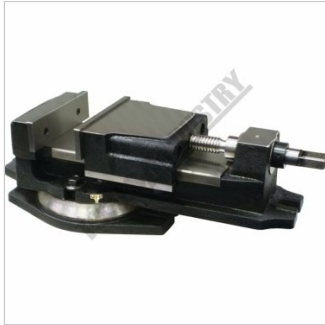
Shown without Handle