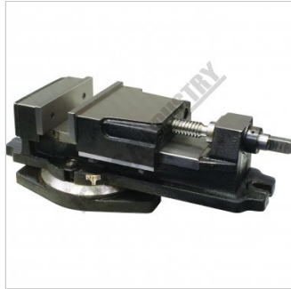
Shown without Handle