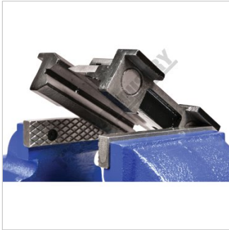
Heavy Duty Mounting Magnets