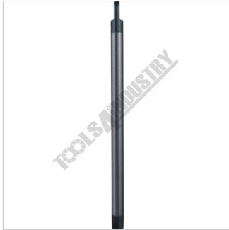
Slim Line Design