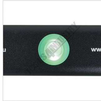
Power Light Indicator