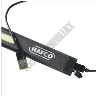
USB Charge Port