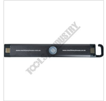
Two Magnetic Points