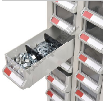
Drawer with Dividers Shown with Parts