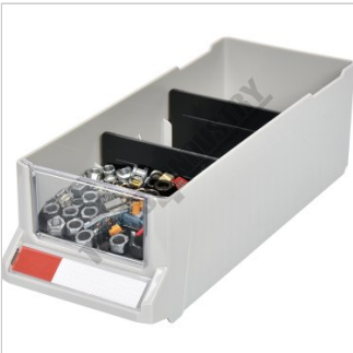
Parts Bin 90 x 218 x 70mm