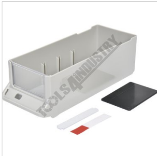
Parts Bin Dividers and Name Tags