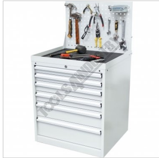
Shown with Optional Hooks & Cabinet - Tool Not Included