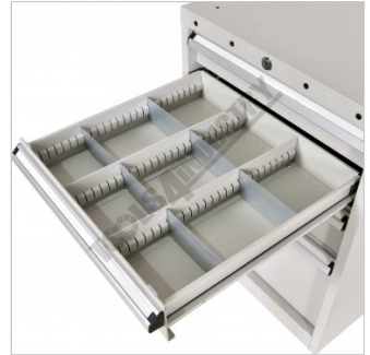
Draws With Adjustable Steel Dividers