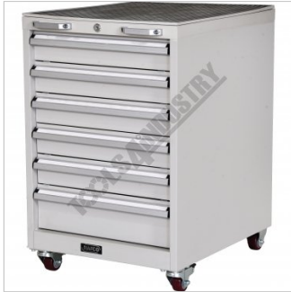
Shown With Optional Wheel Kit