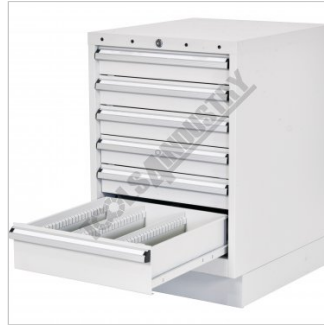
Large Lower Draw