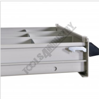
Safety Lock On Draws