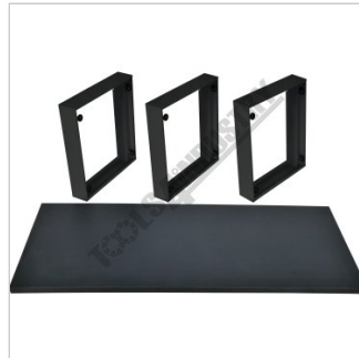
Optional Kick Board & Benchtop Kit