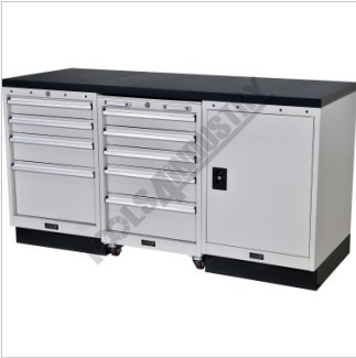
Optional Combination Setup