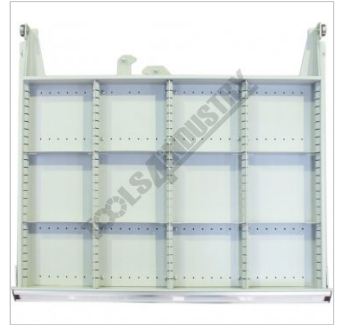
Heavy Duty Drawers