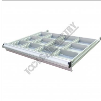
Drawers with Steel Dividers