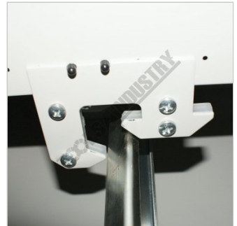
Drawer in Unlock Position