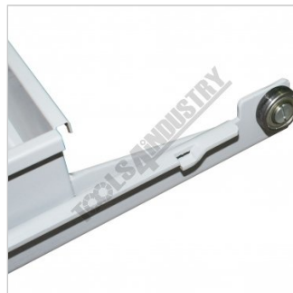
Drawer Ball Bearing Arms