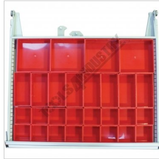
Plastic Bucket Drawers