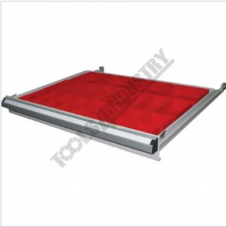
Top Drawer with Plastic Buckets