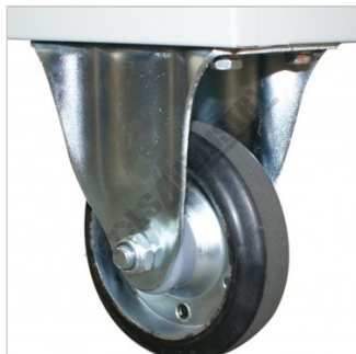
2 x Fixed Wheels