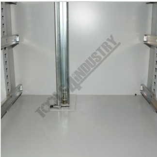
Drawer Locking Mechanism