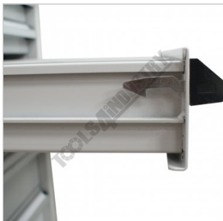
Drawers with Safety Lock