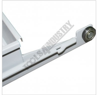
Drawer Ball Bearing Arms