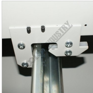
Drawer in Lock Position