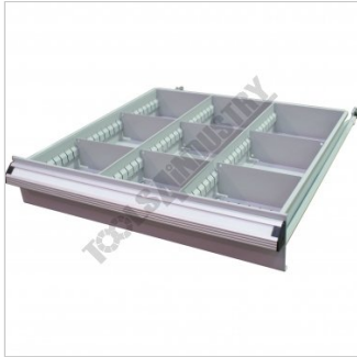
Drawers with Steel Dividers