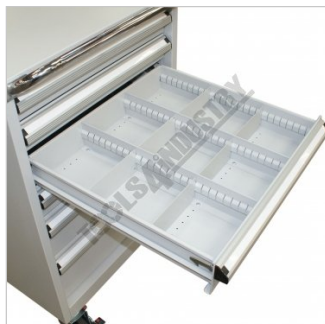
Drawers with Steel Dividers