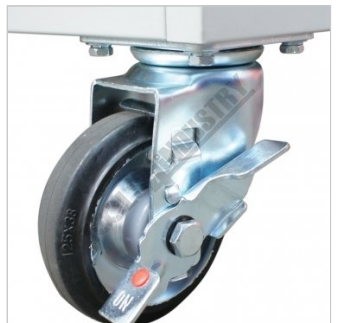
2 x Brake Swivel Wheels