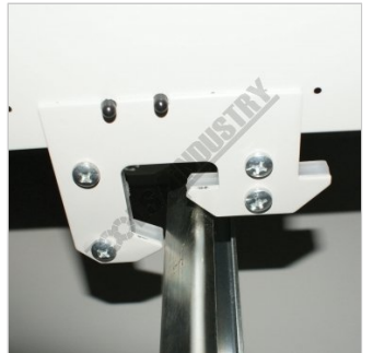
Drawer in Unlock Position