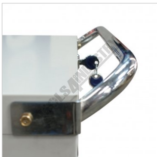
Heavy Duty Push Handle