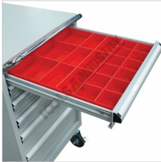
Top Drawer with Plastic Buckets