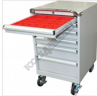
Show with Top Drawer Open