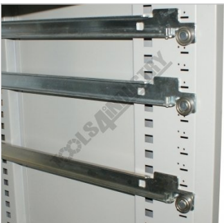
Heavy Duty Drawer Slides