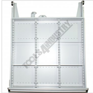
Heavy Duty Drawers