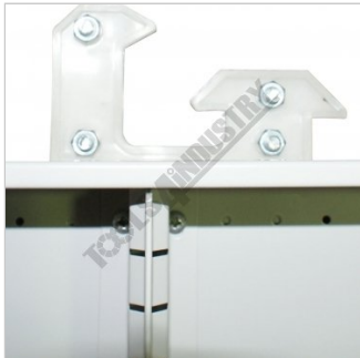
Drawer Lock Bracket