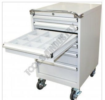
Heavy Duty Drawers with 100kg Load Capacity