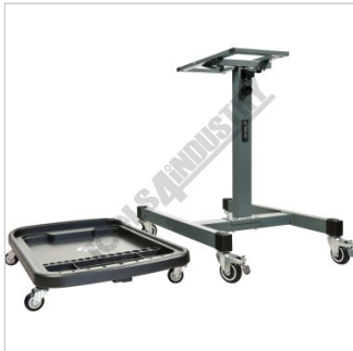
Tray and Stand Separate