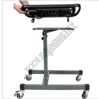
Removeable Top Tray