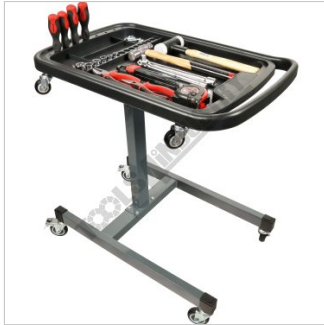
Tools Not Included