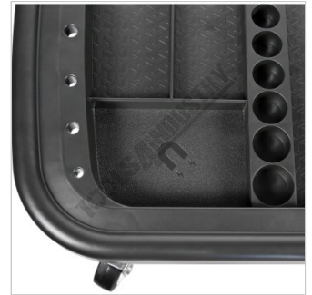
Magnetic Tray Slot