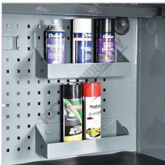
Includes 2 Shelf Containers Shown With Optional Spray Cans