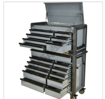
Shown with Optional TDL 447 Tool Chest Open