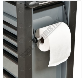
Paper Towel Holder