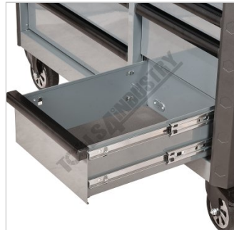
Dual Ball Bearing Slides to Deeper Drawers