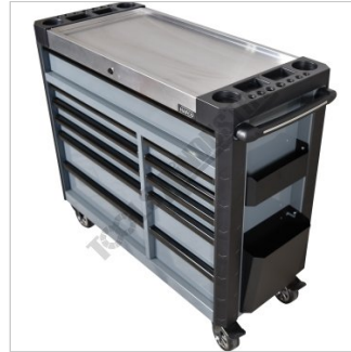
Stainless Steel Top Tray