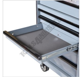
Protective Drawer Liners