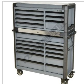
Shown with Optional TDL 447 Tool Chest