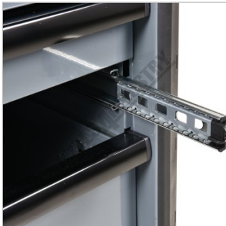
Ball Bearing Slide Drawers