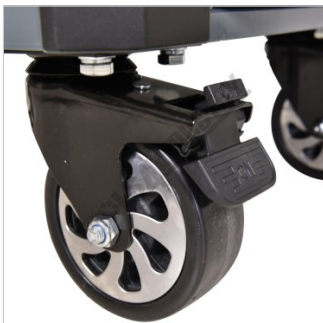
2 x Swivel Brake Wheels