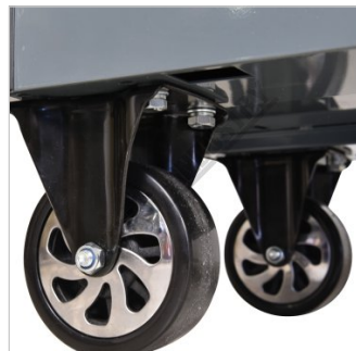
2 x Fixed Wheels