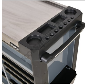
Various Tool Holders and Push Handle