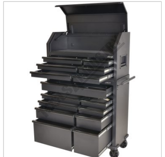
Shown with Optional TIS-426 Tool Chest