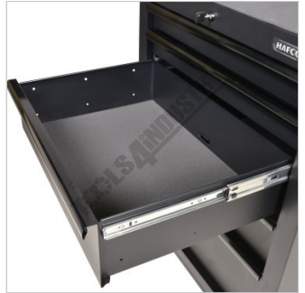
Protective drawer liners