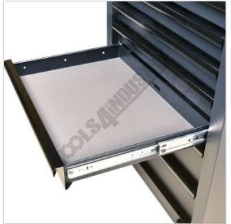
Protective Drawer Liners