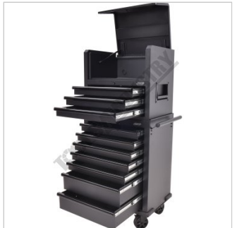
Shown with Optional TIS 263 Tool Chest