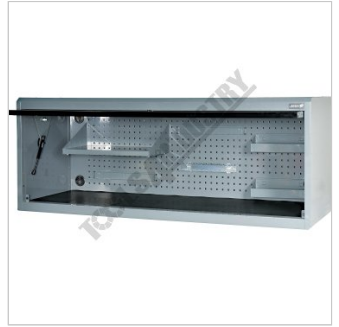
TPS 72H Top Cubby