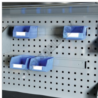
Includes 2 Bucket Holder Brackets With Optional Buckets