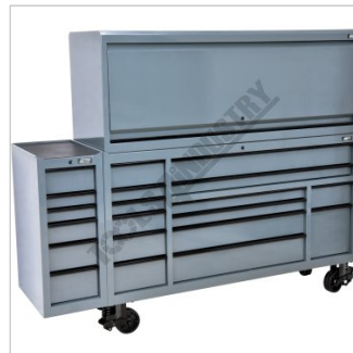
Shown with Optional TPS 75D Side Cabinet