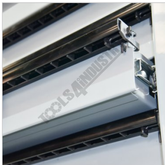
Full Width Drawer Opening Latch