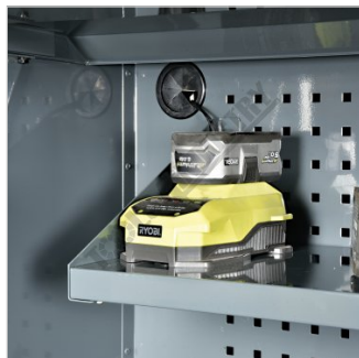
Includes 4 Power Inlets Shown With Battery Charger Not Included