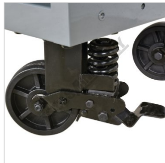
2x Swivel Brake Wheels