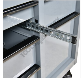
Ball Bearing Slide Drawers