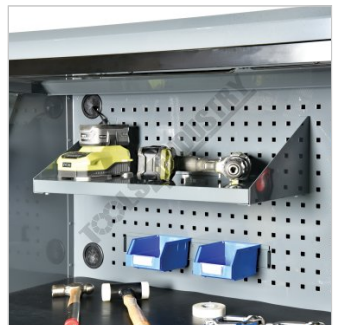
Includes Large Shelf Shown With Optional Power Tools