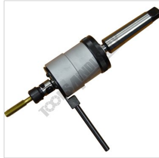
Shown With Tapper