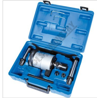
Blow Mold Case