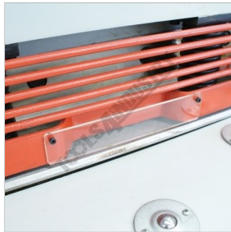
Hi visibility finger safety guard