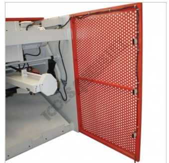
3 x Photo electric rear guarding