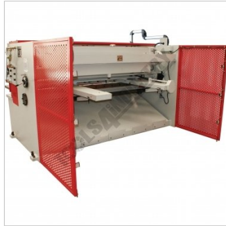
Rear guarding view