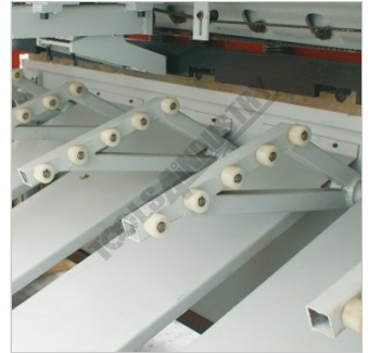
Sheet supports close up