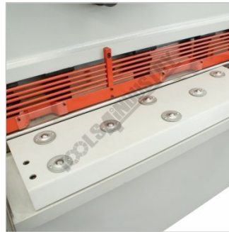
Material transfer balls on the table