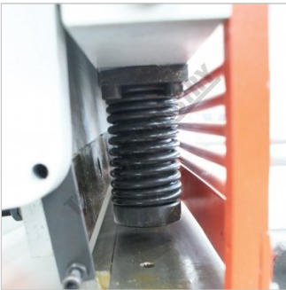
Hydraulic material hold downs