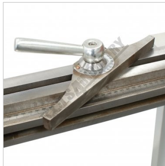
Adjustable and sliding mitre guide