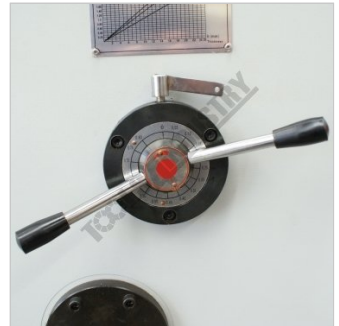
Blade clearance adjustment lever