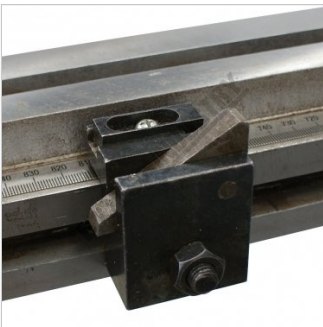
Flip over material stop