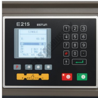
Estun E21S controller