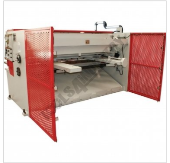
Rear guarding view