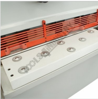
Material transfer balls on the table