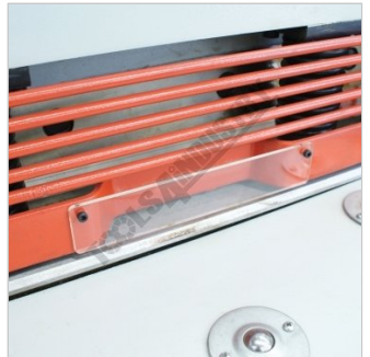
Hi visibility finger safety guard