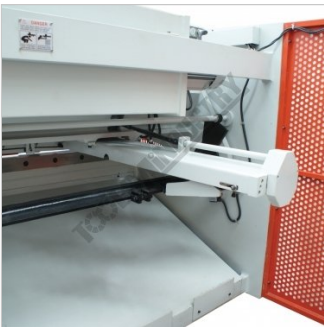
1000mm motorised back gauge