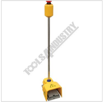
Dual pedal foot control