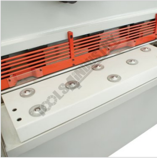
Material transfer balls