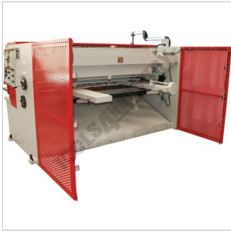
Rear guarding with safety sensors