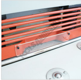
Hi visibility finger safety guard