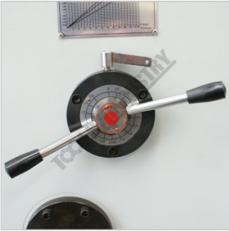
Blade clearance adjustment lever