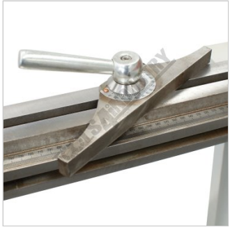
Adjustable and sliding mitre guide