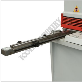
Heavy duty squaring arm