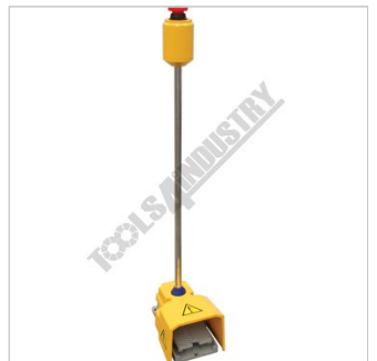
Dual pedal foot control