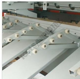
Sheet Supports Close Up