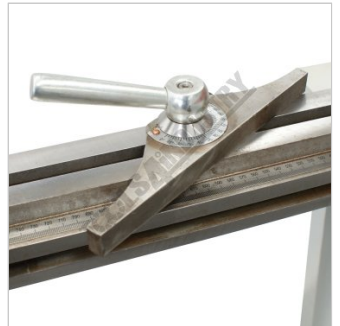
Adjustable and sliding mitre guide