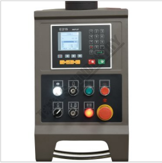
Pendant type control unit