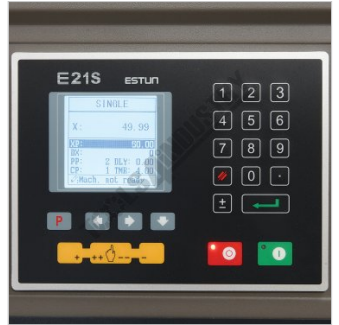
Estun E21 S controller