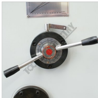
Blade clearance adjustment lever