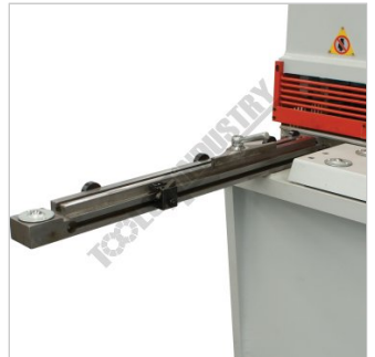
Heavy duty squaring arm