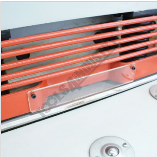
Hi visibility finger safety guard