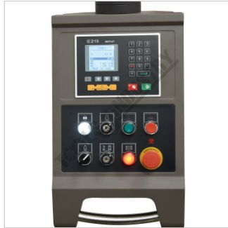
Pendant type control unit