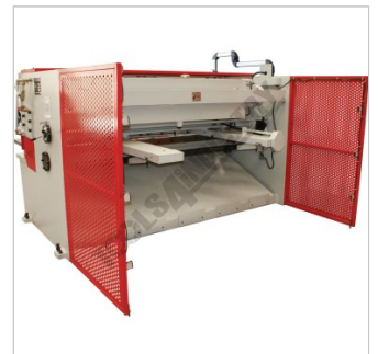
Rear guarding with safety sensors