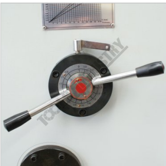
Blade clearance adjustment lever