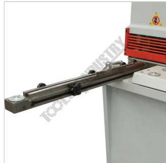
Heavy duty squaring arm