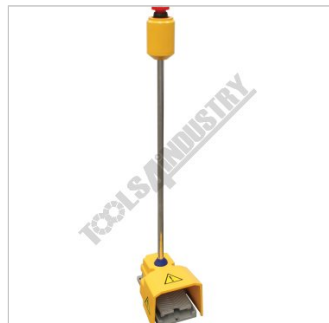
Dual pedal foot control