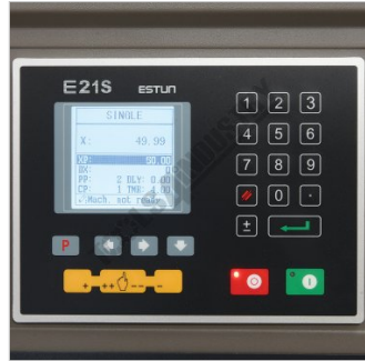
Estun E21S controller