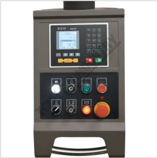
Pendant type control unit