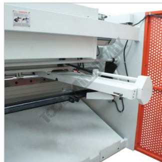
1000mm Ballscrew back gauge