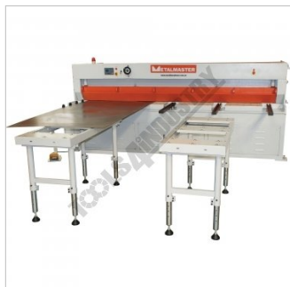
Shown with Optional Ball Transfer Tables - Order Code (L840)