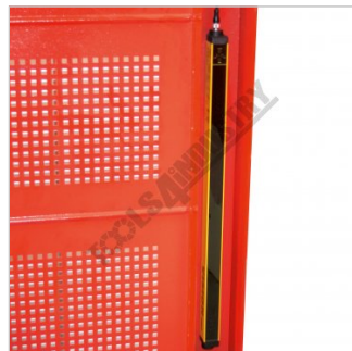
Rear Light Guarding