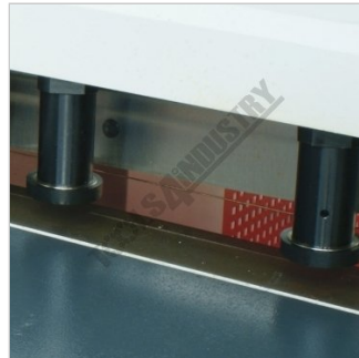
Material Shadow Line