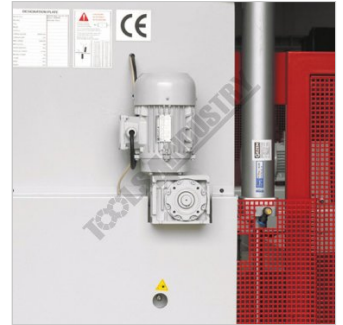
Motorised Blade Gap System