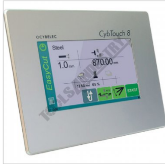
Cybelec Cybtouch 8W Control Unit