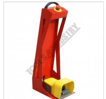
Roving Foot Control