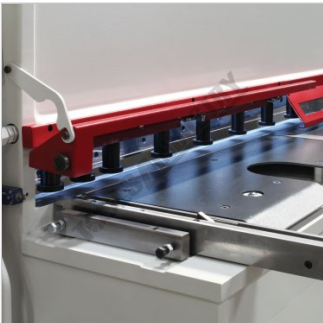
Squaring Arm with Adjustable Stop