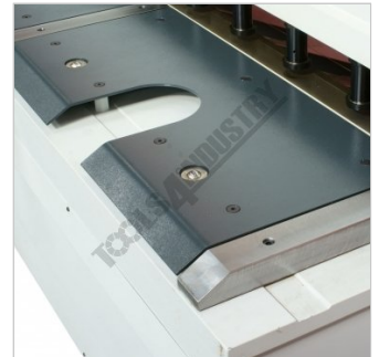
Ball Transfer Table