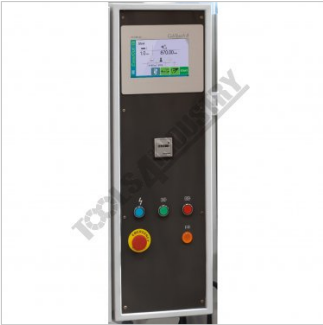
NC Cybelec 8W Touch Screen Control