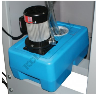
Coolant Pump and Tank