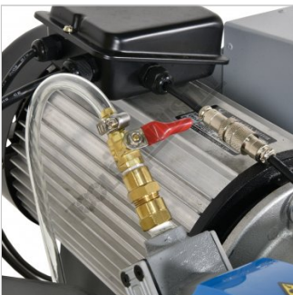
Collant Flow Control Valve