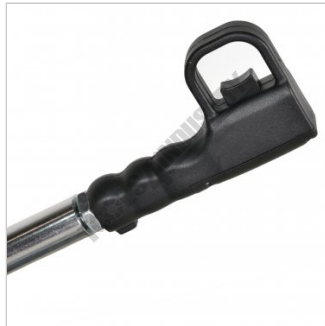
Deadman Trigger Switch