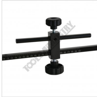
Adjustable Cut Length Stop