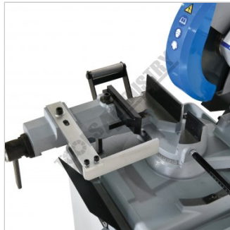
Adjustable Vice Jaws