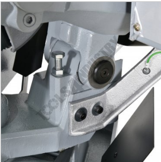
Heavy Duty head Pivot Hinge