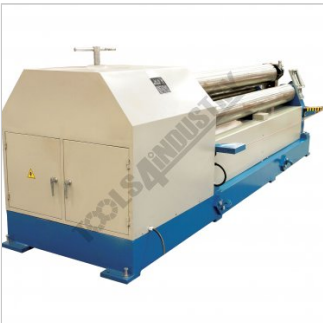
Left Rear View