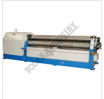
Rear View New