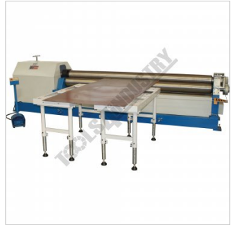
Shown with Optional Ball Transfer Tables