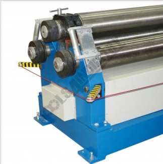
Section Roll End with Flat Bar and Pipe Dies