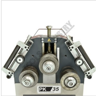
Pair Shown On Machine