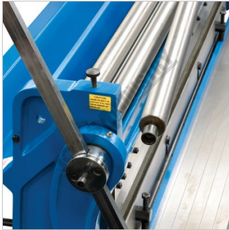
Drive Crank Handle