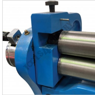
Solid End Housing & Top Roller Lock