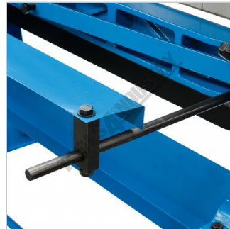
Adjustable Rear Stop