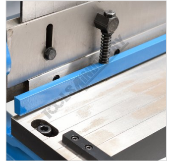
Material Clamp For Shearing