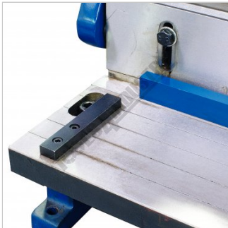
Shearing Square Up Block