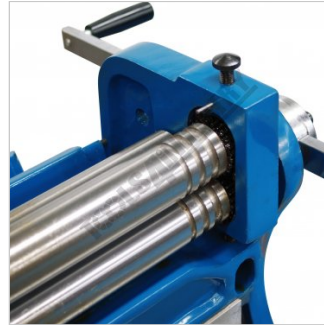
Wire Grooves Rolls