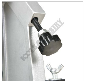
Rear Curving Roll Adjustment Handle