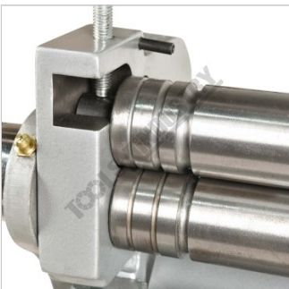
Rear Roll Wire Grooves