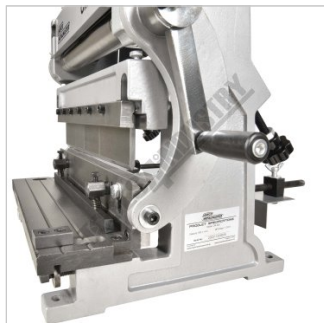
Pressbrake Guillotine Setup