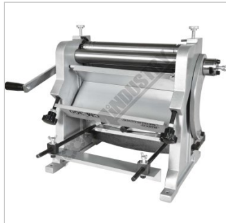
Rear View Rolls Showing