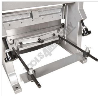
Guillotine Back Gauge