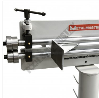
Right Side View Mounted On Machine