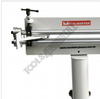
Adjusted To The Front