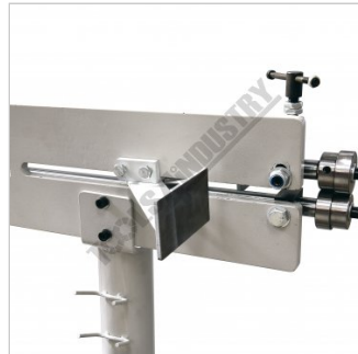
Left Side View Mounted On Machine