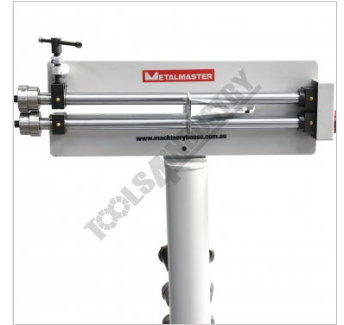
Adjusted To The Rear