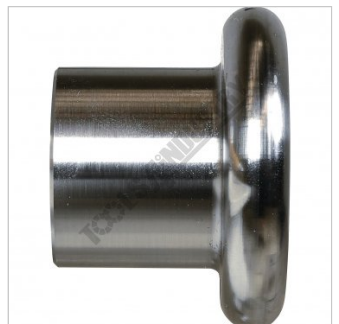
3/8 Inch Tipping Die Side View (G)