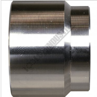
Lower Forming Die Side View (J)