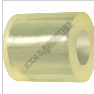
Polyurethane Lower Wheel (A)