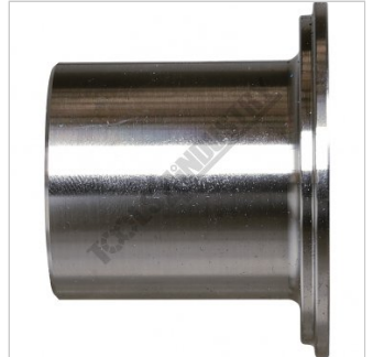
Inside Tipping Die Side View (C)