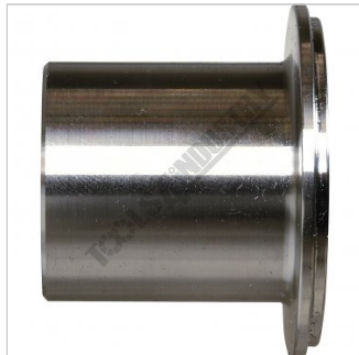
Outside Offset Die Side View (D)