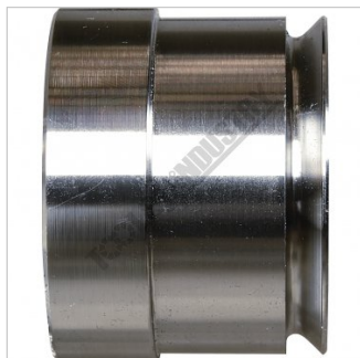
Lower Edge Forming Die Side View (F)