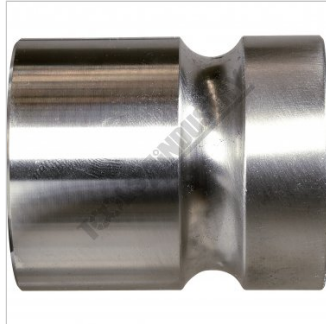
180 Degree Lower Die Side View (B)