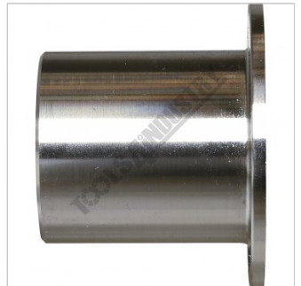
Knife Edge Tipping Die Side View (E)