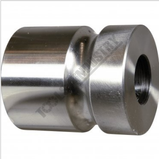
180 Degree Lower Die (B)