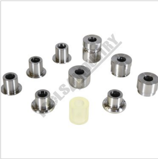
Set Rear View