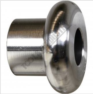
1/2 Inch Tipping Die (H)