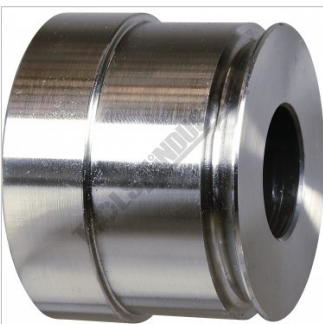
Lower Edge Forming Die (F)