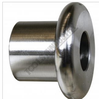
3/8 Inch Tipping Die (G)