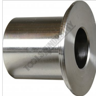
Inside Tipping Die (C)