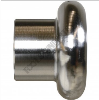
1/2 Inch Tipping Die Side View (H)