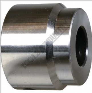
Lower Forming Die (J)