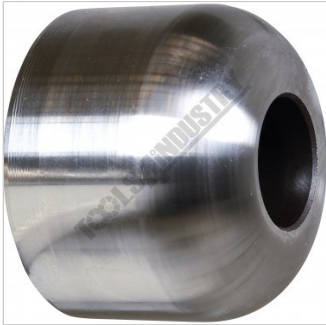
Round Tipping Die (I)