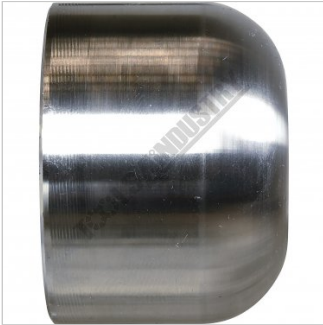
Round Tipping Die Side View (I)