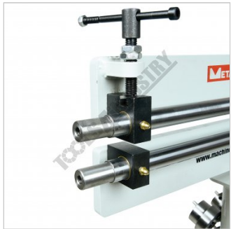
22mm Spigot for Mounting Rollers