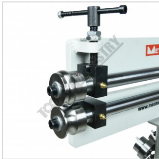
Shown With 1/2" (12.7mm) Beading Rolls