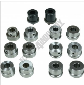
Includes 7 Sets of Rolls