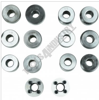
Roll Sets Top View