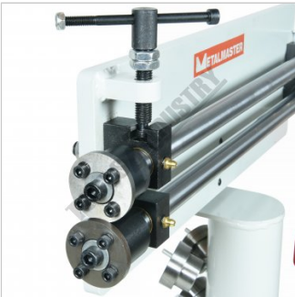
Top Roll Pressure Adjustment Handle