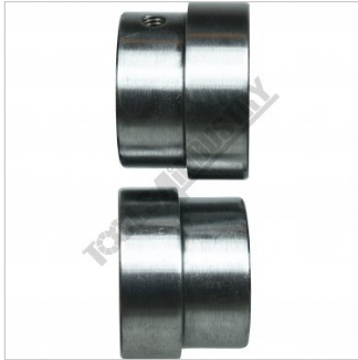
1/8 Inch (3mm) Flange Rolls