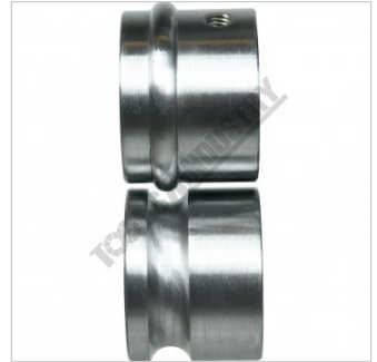
1/4 Inch (6.35mm) Beading Rolls