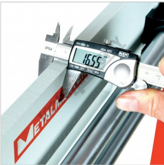
16mm Plate Steel