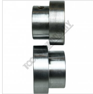
1/4 Inch (6.35mm) Flange Rolls