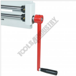
Manual Crank Handle