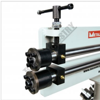
Shown with Shearing Dies