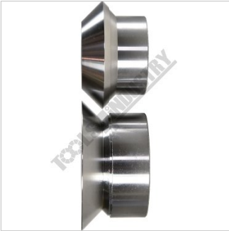
Set 1 Side View