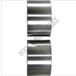
Set 3 Side View