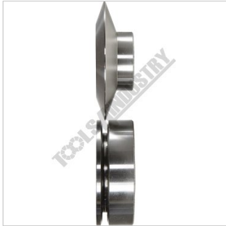
Set 2 Side View