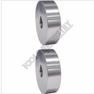
Narrow Blank Roller Set Rear View