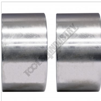
Wide Blank Roller Side Profile View