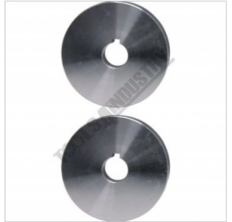
Narrow Blank Rollers Rear View