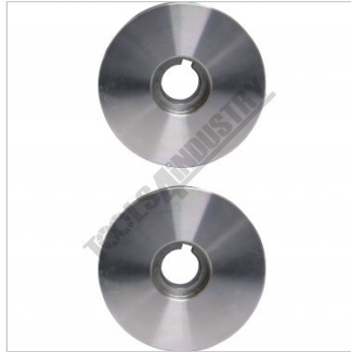
Narrow Blank Roller Front View