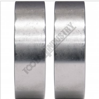
Narrow Blank Rollers Side Profile View