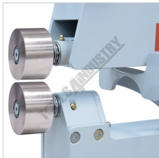
Shown on Machine