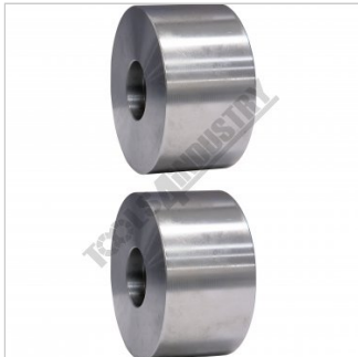
Wide Blank Roller Set