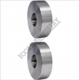
Narrow Blank Roller Set