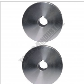
Wide Blank Rollers Rear View