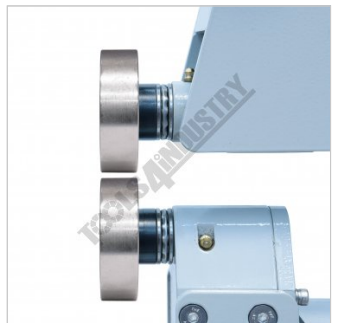
Shown on Machine Side View