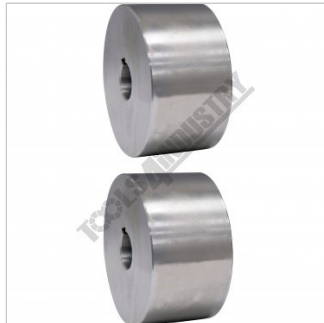
Wide Blank Roller Set Rear View