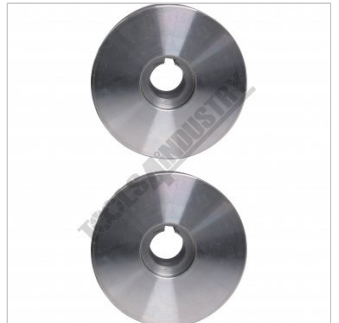
Wide Blank Rollers Front View