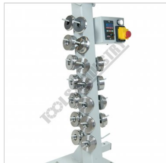
Die Rack Holders Left View