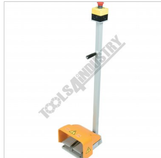
Forward & Reverse Foot Control With Emergency Stop Switch