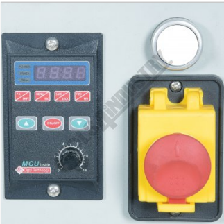
Speed Control and On Off Safety Switch