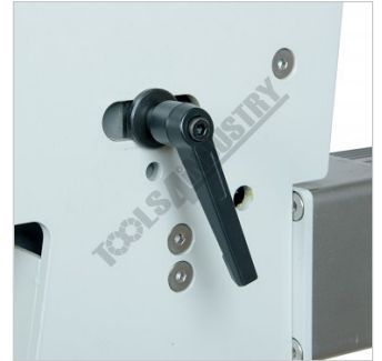
Locking Levers For Top Shaft Die Alignment