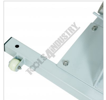
2 X Rear Wheels For Mobility