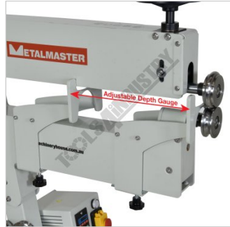
Adjustable Depth Gauge