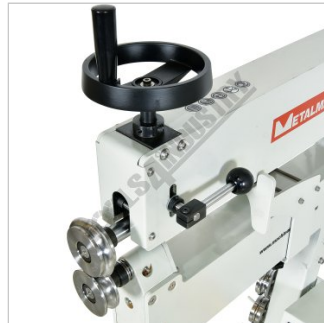
Upper Mandrel Adjustment Handle