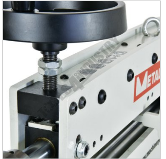
Dual Wall Frame