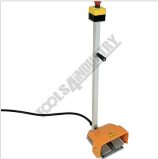
Foot Control With Emergency Stop