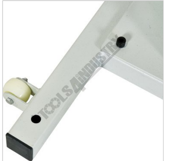
2 x Rear Wheels For Mobility