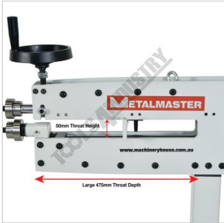
475mm Throat Depth and 50mm Height