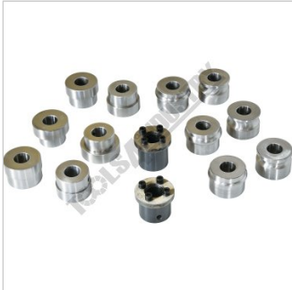
Die Set Included