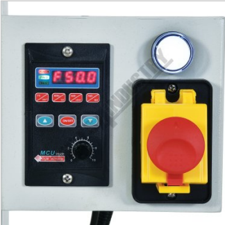
Speed Control On Off Safety Switch