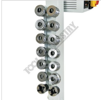
Die Rack Holder