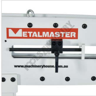
Adjustable Material Depth Stop