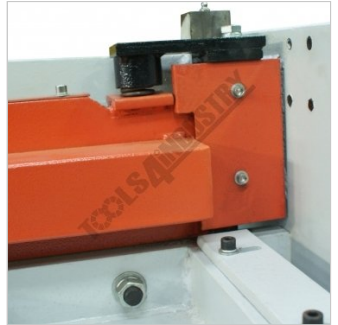
Material Clamp Front View