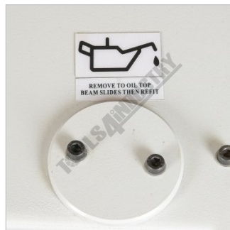
Oil Refil Points