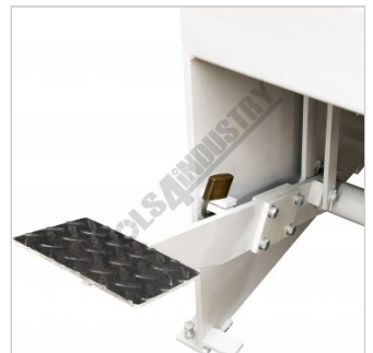
Foot Pedal Lever Shown Locked with Optional Padlock