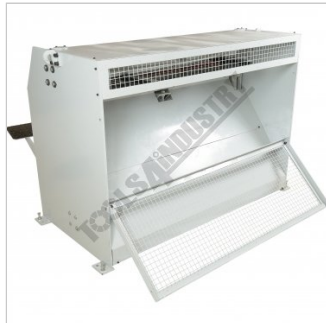
Rear Swivel Safety Guard