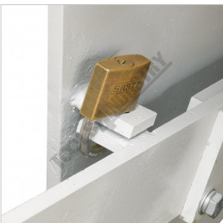
Isolation Tabs Shown Locked with Optional Padlock