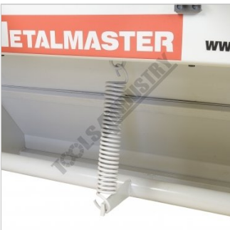
Spring Return Clamp Beam & Foot Pedal