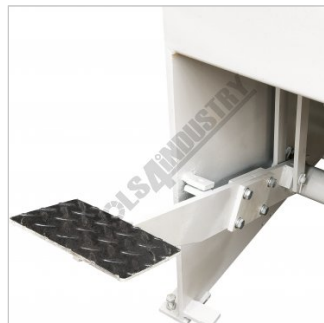
Foot Pedal Lever