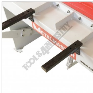
Front Sheet Support