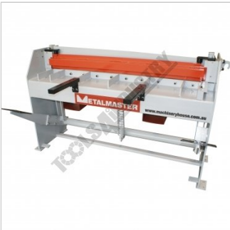
Right Top View