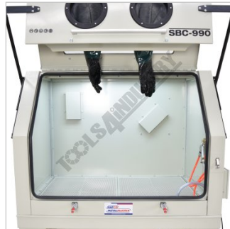
Inside Work Area