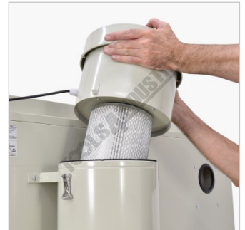
Removing Motor Filter Assembly