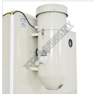
Dust Collector and Filter System