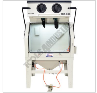
Front View Lid Open