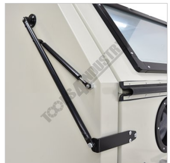
Gas Strut Door