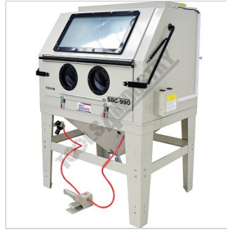
Side View Lid Closed