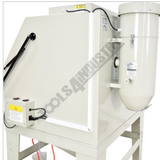
Rear Right View Close Up