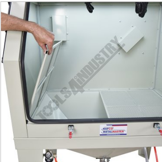
Hopper with Removable Gates