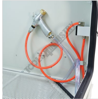
Gun on Hanging Hook