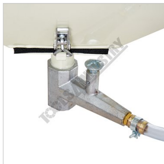
Abrasive Metering Valve