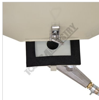
Hopper Emptying Hatch