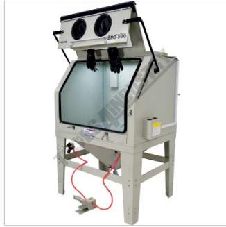
Side View Lid Open