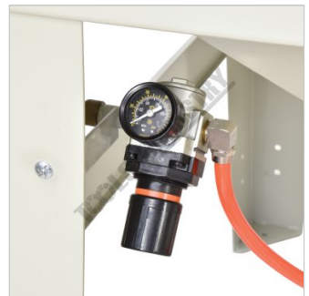
Air Pressure Gauge