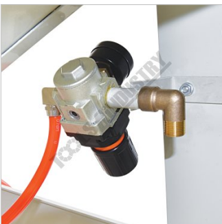
Compressed Air Inlet Connection