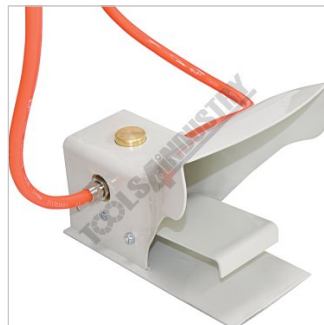
Foot Pedal Blasting Switch