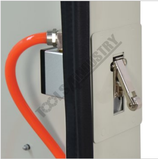
Door Safety Interlock