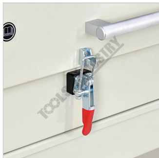
Lid Open Latch