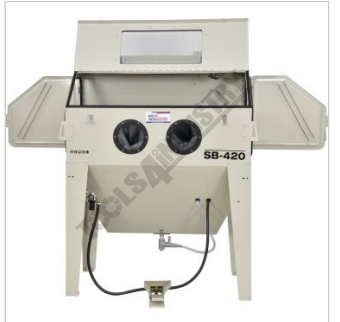
Front View All Doors Open