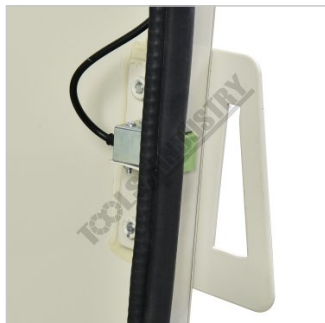
Door Safety Interlock