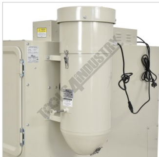
Dust Collector and Filter System