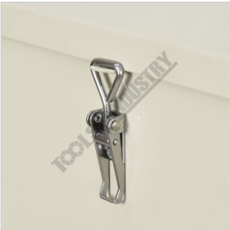
Top Lid Latch