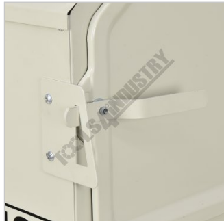
Side Door Handle