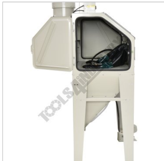
Left Side View Side Door Open