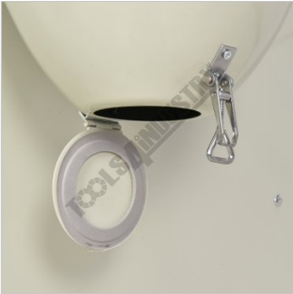
Dust Collector Emptying Hatch