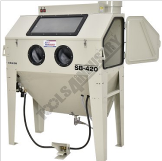
Side Door Open