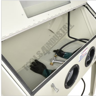
Hopper with Removable Grates