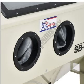
Gloves Front View