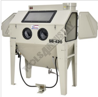
Side Doors Open