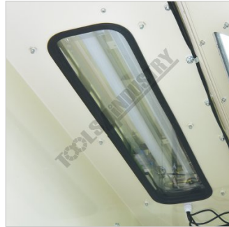
Internal Light with Tear Off Film on Glass