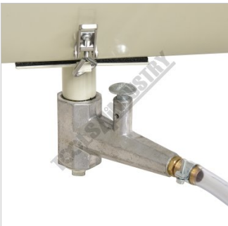
Abrasive Metering Valve