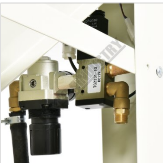
Compressed Air Inlet Connection