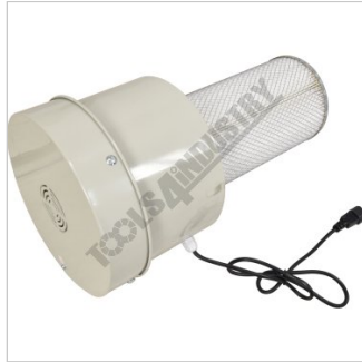
Motor Filter Assembly Removed