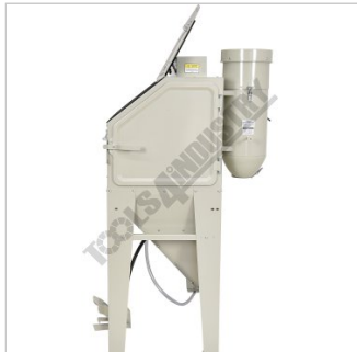
Right View Lid Open