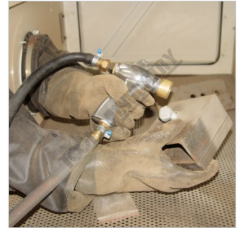
Industrial Duty Blast Gun