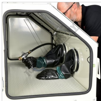
Gloves and Gun Action Shot