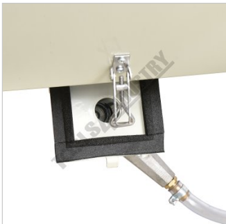
Hopper Emptying Hatch