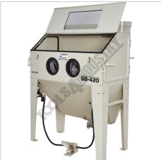
Right View Top Lid Open