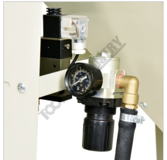
Air Pressure Gauge Assembly