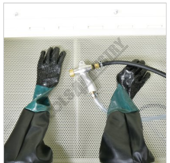
Gloves Top View