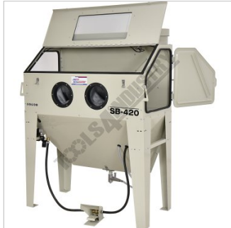
All Doors Open