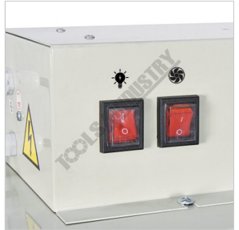
Switches for Light and Dust Collector