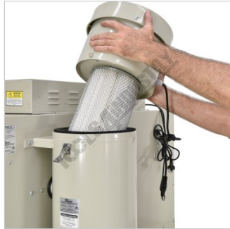
Motor Filter Assembly Being Removed