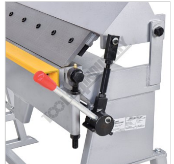
Material Clamp Blade Lever Down