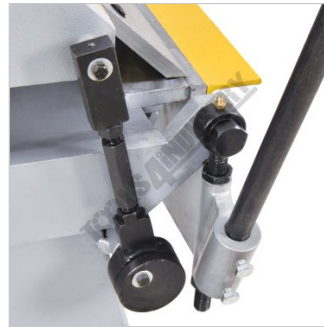
Lubrication Points Left Side