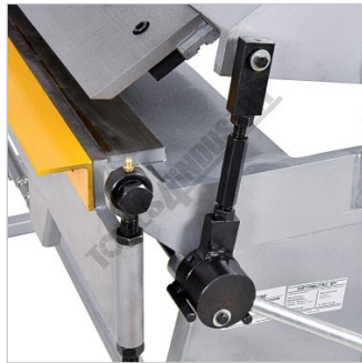
Lubrication Points Right Side