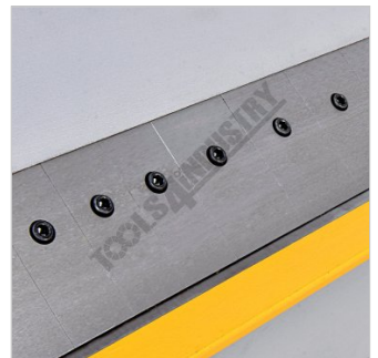
Removable Fingers for Bending Pans or Boxes